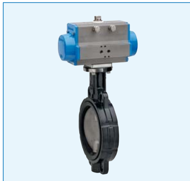
Art. 8P009700 EPDM Art. 8P019500 NBR

Butterfly valve "WAFER" type PN16, body in cast iron G250 + Epoxy painting, disc in GGG40 nickered, EPDM [Valpres Art. 600104] or NBR [Valpres Art. 600117] seat, with actuator.