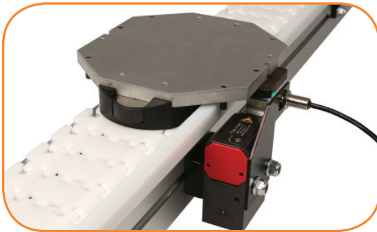
Cushioned Pallet Stop