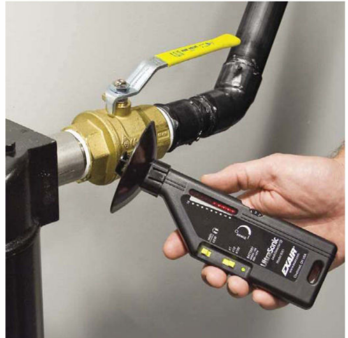
The Model 9061 Ultrasonic Leak Detector quickly pinpoints a costly leak in a noisy industrial environment.

Ultrasound is directional in transmission and is loudest at the source. Turbulence created by the air forced through a small orifice generates ultrasonic sound. This emitted sound is called “white noise” and occurs when the air moves from a high pressure area such as a pipe or vessel and escapes to a low pressure area such as the room. The Ultrasonic Leak Detector converts the turbulent flow to a frequency that can be heard using the headphones. As the ULD moves closer to the leak, more LEDs on the display light to confirm the source of the leak.