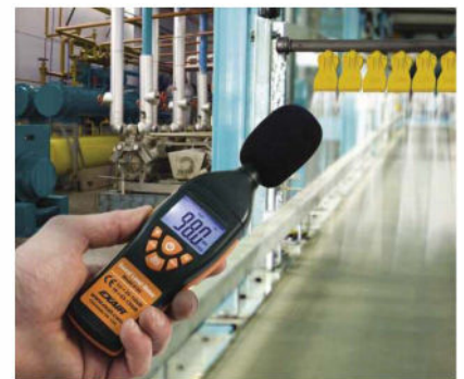
The Sound Level Meter identifies a potential source of hearing loss.