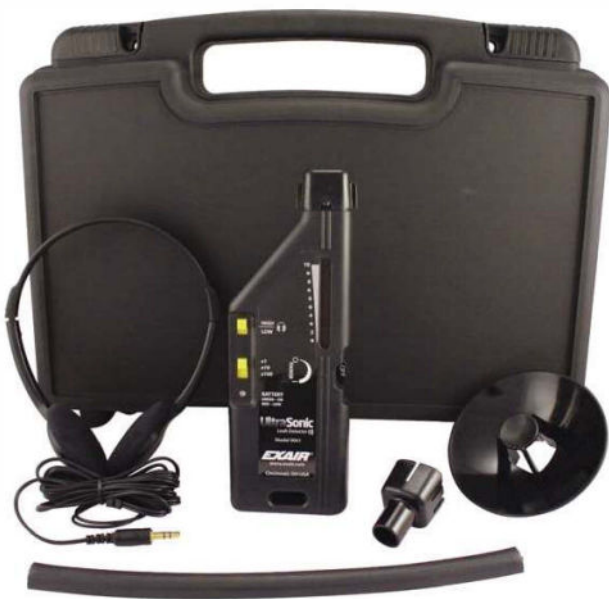
The Model 9061 Ultrasonic Leak Detector comes complete with a hard-shell plastic case, headphones, parabola, tubular adaptor, tubular extension and 9 volt battery.

In some cases, the suspected leak is in a hot area and/or close to moving parts. The tubular extension and parabola make it possible to probe these difficult locations from a distance to isolate the leak.