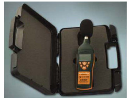
Model 9104 Digital Sound Level Meter comes complete with removable wind screen, battery and a protective case.