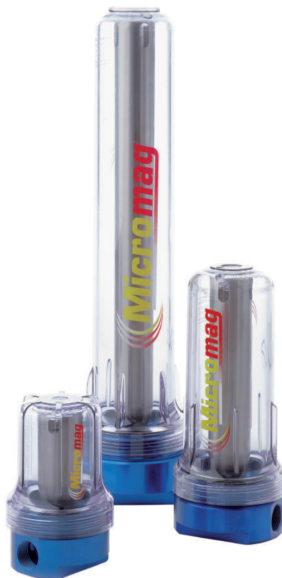
Magnetic circuit & fluid flow path.