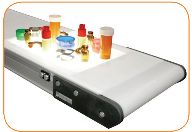
Ideal for a variety of products