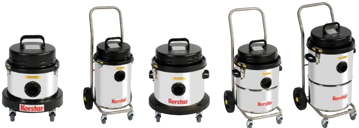
KAV 15, 18, 20, 30 and 45