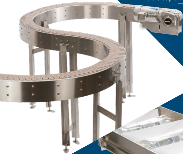
Table top chain

Fully adjustable incline & decline modules