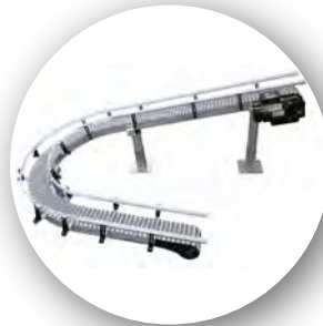
Helical Plain Bend